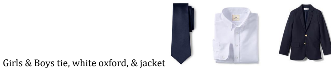
Girls & Boys tie, white oxford, & jacket